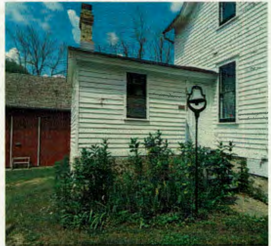
Mill House Summer Kitchen