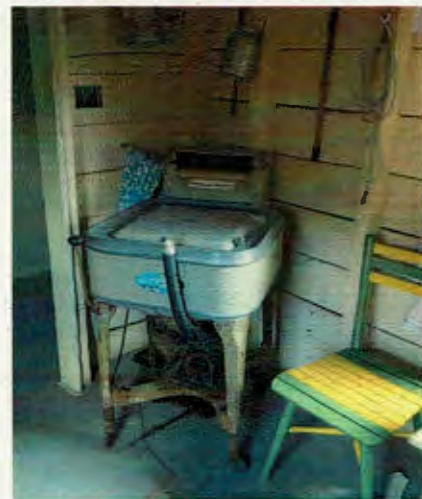
Mill House Summer Kitchen