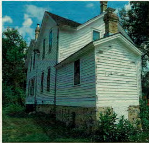
Mill House Summer Kitchen

The summer kitchen at the Messer/Mayer Mill House was once a separate, stand-alone building, built in the late 1860s by the Andrew Messer family. It still has its original cook stove. It was attached to the main house via a small vestibule sometime during the 1890s when the C.W. Mayer family built an addition to the original house which included three more bedrooms upstairs, plus a pantry, utility/storage room and a beautiful new kitchen on the main floor. The addition sits on the southwest corner of the main house and is accessed not only from a door leading to the outside, but also through the utility room which has direct access to the root cellar. It was once one of the hardest working buildings on the farm, and the Richfield Historical Society has worked hard to preserve the history of this unique building.