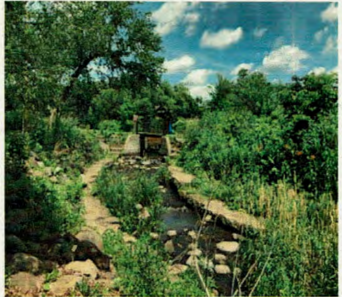
“Beckman Mill fish ladder, 150 feet long, 12 feet wide, with a water depth varying from 3 to 5 feet”

These stones are mounted inside a circular wooden box called a “vat.” Like the special stones in the Messer Mayer Mill, these stones in the Beckman Mill have a center hole through which the grain flows from the second floor, and are cut from