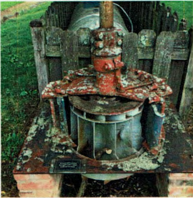
“Leffel undershot water turbine – with what appears to be stationary blades – with a vertical shaft connected on top that rotates as the turbine rotates”

a quarry outside of Paris, France. The “spur gears” were made of cast iron and wooden teeth designed to reduce the shock, noise, repair costs, and danger of sparks which are much greater when using strictly iron teeth.