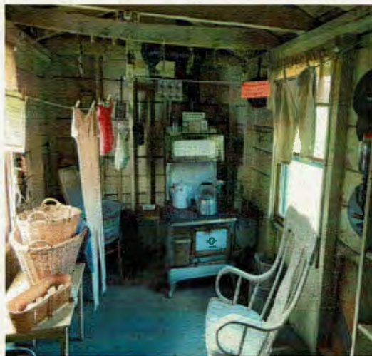
Mill House Summer Kitchen