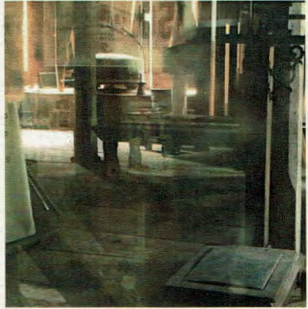
“Leffel undershot water turbine - with what appear to be a picture taken through the window of the Beckman Mill showing the ‘vat’ containing the mill stones; note the vertical boxed wooden shafts which carry the leather belts with small cups that carry the grain to the upper floor to be sifted, sorted, and subsequently stored for bagging; as well as a scale in the right foreground used to weigh in-coming sacks of grain and out-going finished sacks of flour”

A Beckman Mill “Visitor Center” was constructed in 2006 by the “Friends of Beckman Mill’s” volunteer work crew – not unlike the Messer Mayer Mill volunteer work crew which, among many projects, re-constructed the Lillicrapp House that was moved from Amy Belle Lake to become the “Welcome Center’s General Store” gathering place, and hopefully in the future, the library research center for history. The “Visitor Center” at the Beckman Mill, similar in some ways, houses a general store, gift shop, creamery display, blacksmith shop display, and modern rest-rooms, as well as a meeting room and office on the second floor.