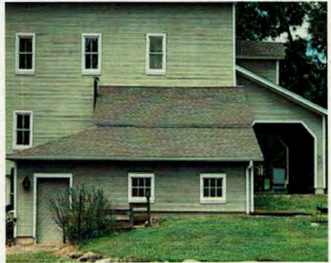
“Reconstructed Mill with new siding, roof, windows, paint, and foundation with a covered drive-through entryway for the horse-drawn wagons bringing the grain to be milled.”